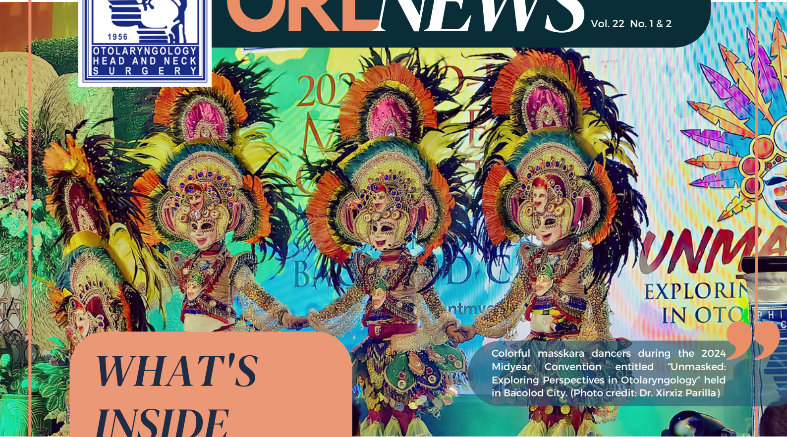
Colorful masskara dancers during the 2024 Midyear Convention entitled "Unmasked: Exploring Perspectives in Otolaryngology" held in Bacolod City.