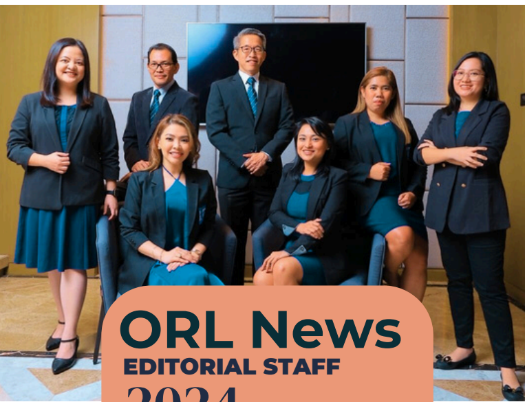
ORL News EDITORIAL STAFF 2024

Together, we stand 70 years strong —and the best is yet to come! |