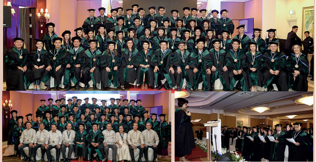
Fellow's Induction/Fellow's Oathtaking, Nov. 30, 2018