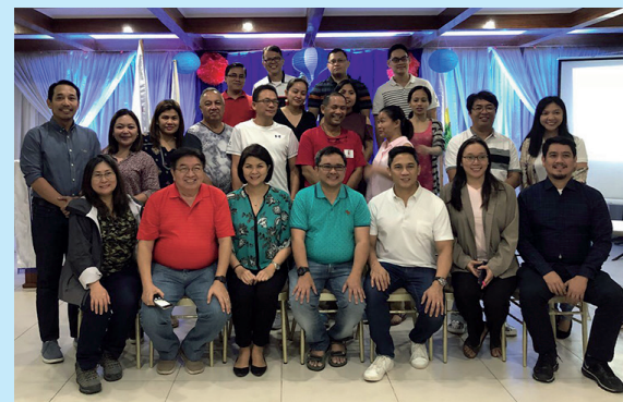
Northern Mindanao Chapter Visit, Feb. 16-18, 2018