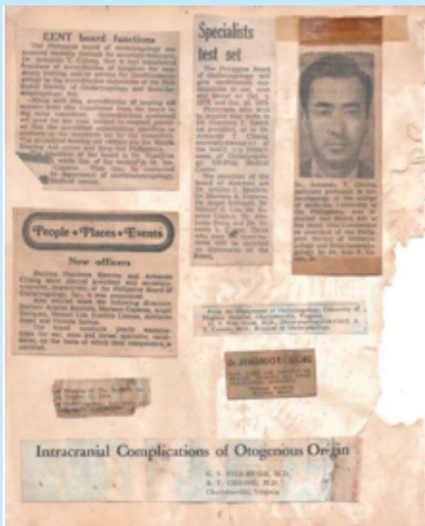
Figure 2: Scanned Photo of his Newspaper Clippings in his Album

grooming and style were legendary. His distinguished taste of obtaining only the best from pens to clothing and even to cars were reflective of his personal dictum of not settling for anything other than the best. Of all his undertakings however, it was as a devoted father to his children that he cherished most. A strict disciplinarian from the outset, he was so devastated by the loss of one child that henceforth he never failed to convey his unconditional love to his children. He did not fail to talk to each one everyday even when they all stayed in Manila with long distance calls to each and everyone. He gave full support (financial and otherwise) so that his children can obtain the best residency and fellowship training from centers of excellence with the view of sharing this knowledge later to others in the academe.