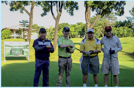
1st PSOHNS-RBGM Medical Golf Tournament Nov. 29, 2018 at Villamor Golf Club