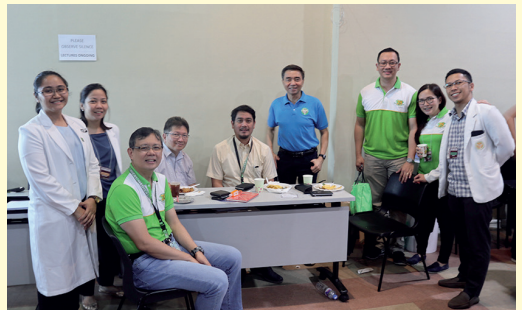
Northern Luzon Chapter Visit, March 10, 2018