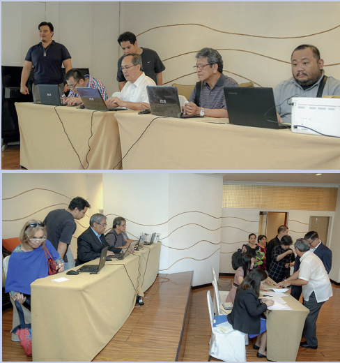
Election of New Board of Trustees, Dec. 1, 2018