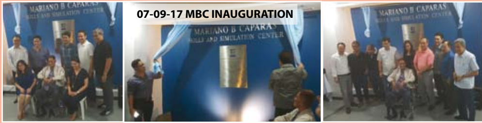
07-09-17 MBC INAUGURATION