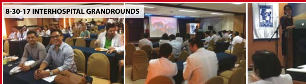
8-30-17 INTERHOSPITAL GRANDROUNDS