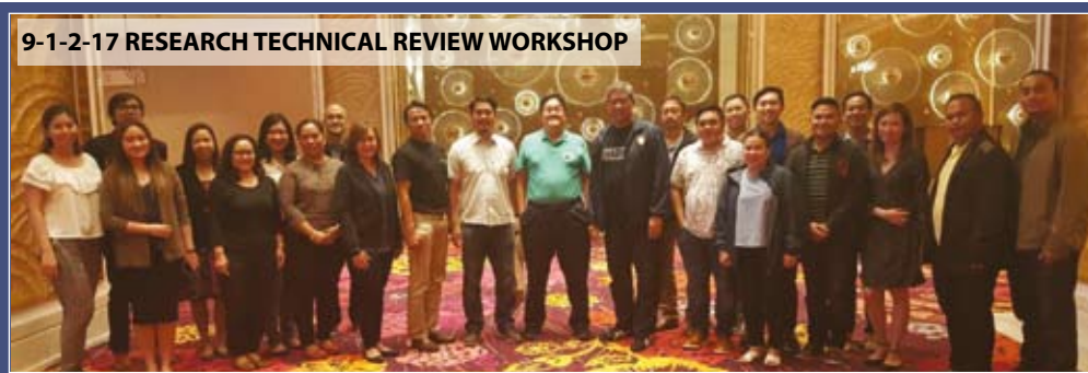
9-1-2-17 RESEARCH TECHNICAL REVIEW WORKSHOP