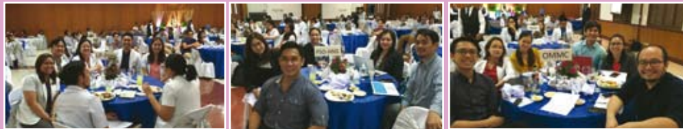
08-10-17 DESCRIPTIVE RESEARCH CONTEST