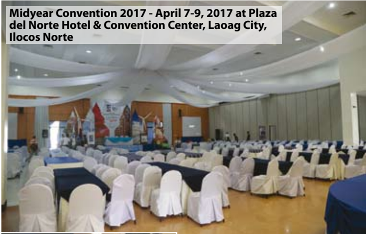
Midyear Convention 2017 - April 7-9, 2017 at Plaza del Norte Hotel & Convention Center, Laoag City, Ilocos Norte