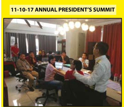
11-10-17 ANNUAL PRESIDENT'S SUMMIT