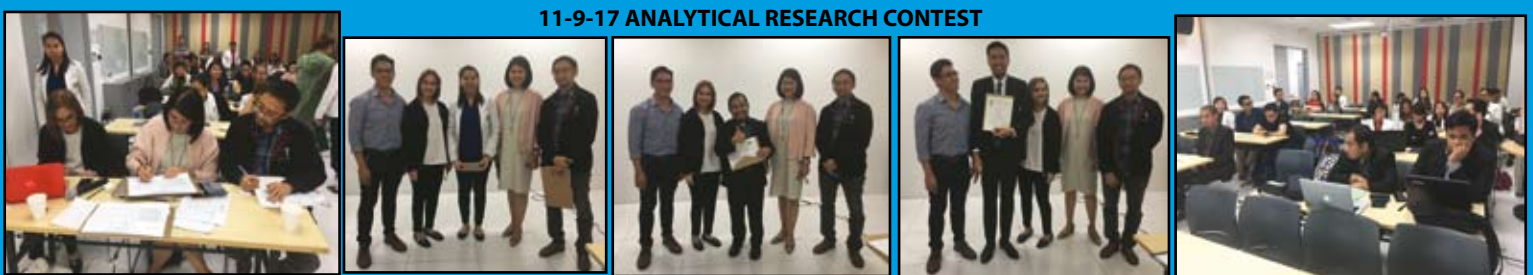
11-9-17 ANALYTICAL RESEARCH CONTEST