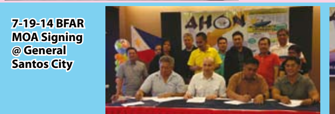
7-19-14 BFAR MOA Signing @ General Santos City