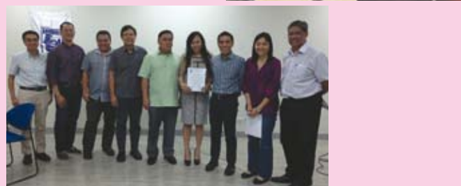
7-19-14 BFAR MOA Signing @ General Santos City