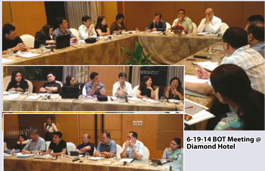
6-19-14 BOT Meeting @ Diamond Hotel