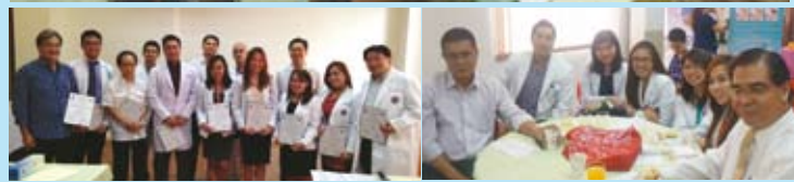
9-18-14 Descriptive Research Contest @ Natrapharm