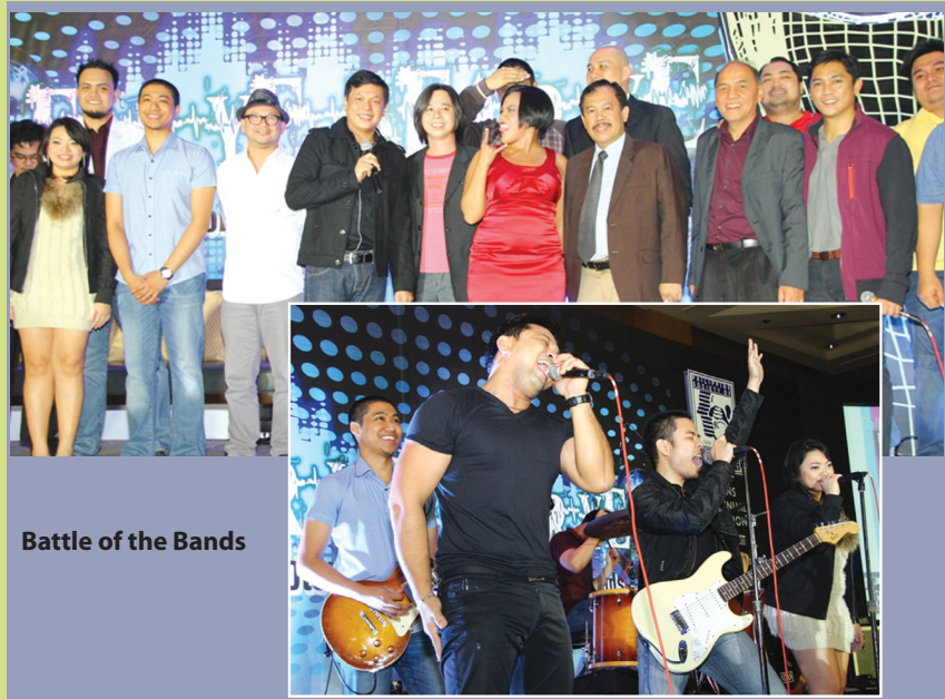
Battle of the Bands