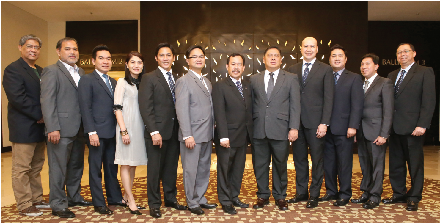
THE PHILIPPINE SOCIETY OF OTOLARYNGOLOGY-HEAD AND NECK SURGERY, INC. BOARD OF TRUSTEES 2014