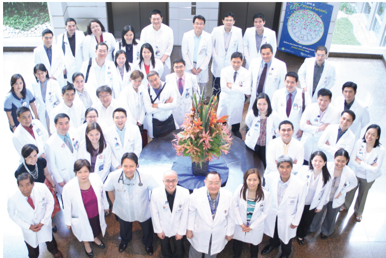
Module for the Head and Neck at the Ateneo School of Medicine and Public Health Year Levels 5 (1st Yr), 6 (2nd Yr) and 7 (3rd Yr).

The department launched its Cochlear Implant Program in August 2013. It is the first comprehensive program for hearing impaired adults and children. A number of other noteworthy events are planned for 2014. These include activities to celebrate Oral, Head and Neck Cancer Awareness Week (OHANCAW) and World Voice Day in April, a post – graduate FESS course in July as well as our regular lay forums on Obstructive Sleep Apnea and Dysphagia.